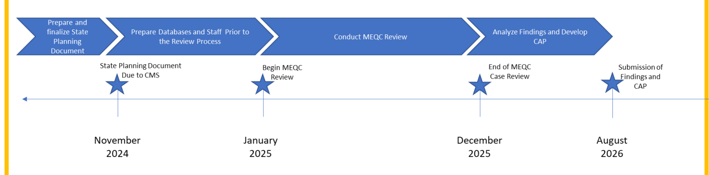
Figure 2. Timeline for the MEQC process.

The notional timeline for implementing this plan and complying with the full MEQC cycle review is included below ( Figure 2 ):